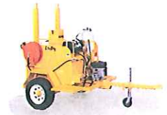
150 Tack Distributor