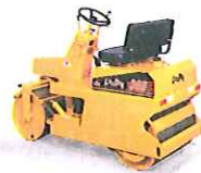
300 Asphalt Roller