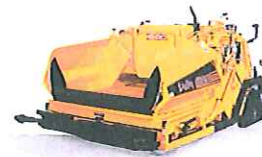
8500 Asphalt Paver